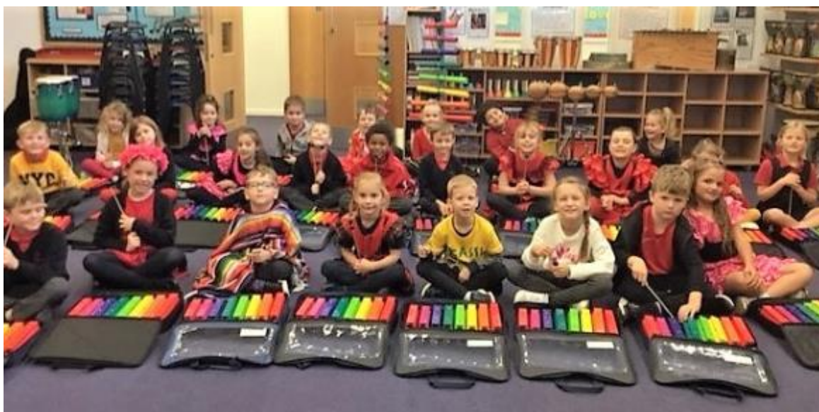
Year 2 learning about Pitch, using Chime Bars.